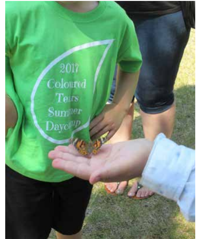
Colored Tears Summer Daycamp Butterfly Release