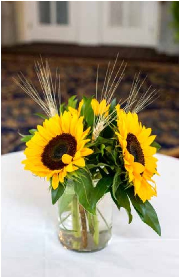
Sunflowers are the international symbol of Hospice – seen at the Dr. Helen Hays Sunflower Luncheon, 2017.

Pilgrims Hospice Society provides supportive and compassionate family centred care to enhance the quality and dignity of life for those diagnosed with a progressive, life-threatening illness, as well as solace to those who are bereaved.