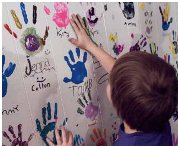
Healing Grief through Expressive Arts

Response to this pilot program has been extremely positive.