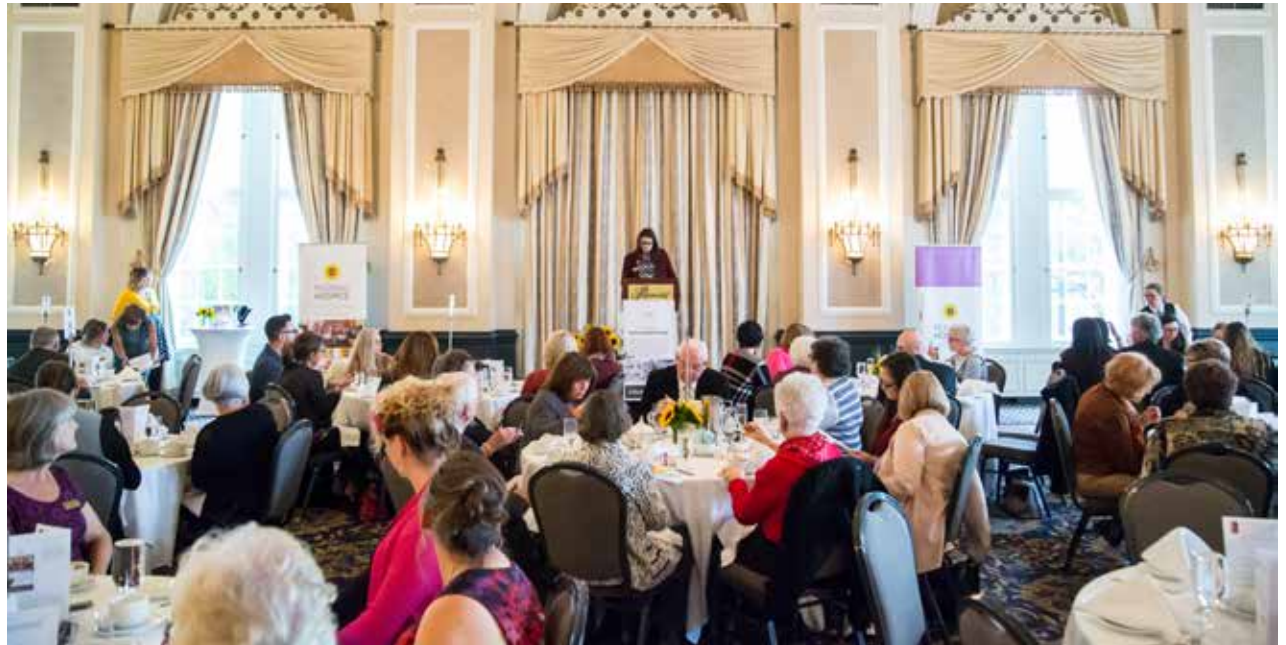
Dr. Helen Hays Sunflower Luncheon, 2017

We are grateful to every guest and sponsor who attended and supported our fundraising events – the Annual Gala, Hike for Hospice, Charity Golf Classic and the Sunflower Luncheon. These special events generated over a third of our revenue for the year.