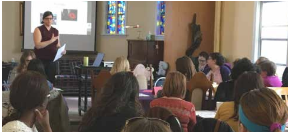
Grief First Aid for Professionals

Alberta Health Services Alzheimer's Society Glenrose Rehabilitation Hospital Grief Support Providers Network Health for Two MacEwan University Mother Teresa School Ronald McDonald House St. Albert Bereavement Fellowship St. Stephens College University of Calgary