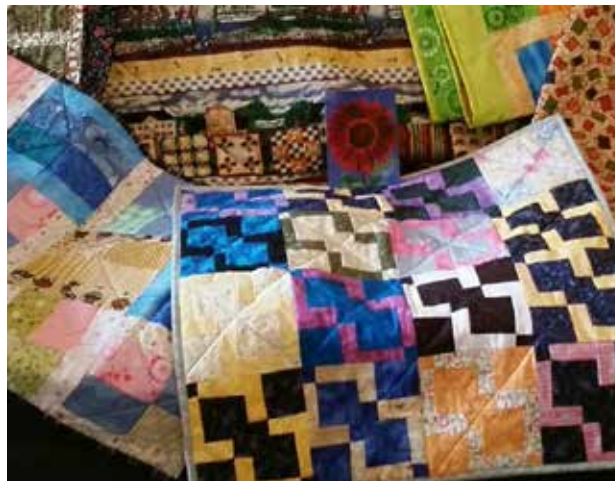
Quilts lovingly made for our clients

This funding, along with a generous gift from the Royal Alexandra Employees Charitable Donation Fund , also allowed us to reduce or completely waive the small fee charged to sustain the program, for the many clients unable to afford support services.